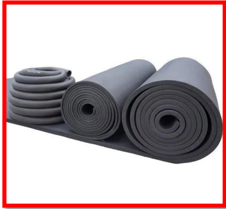
NITRILE RUBBER SHEET