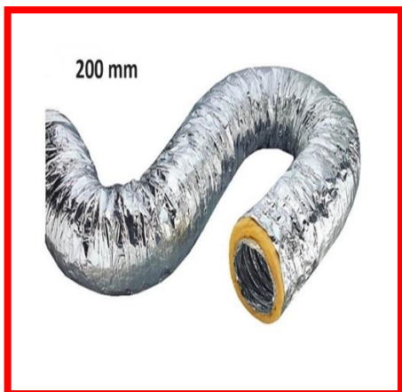
FLEXIBLE DUCT - INSULATED